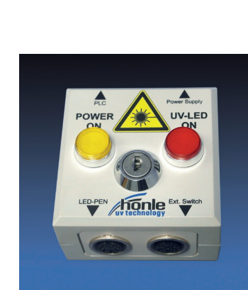
Control unit LED Power Pen (option)

Panacol-USA Inc., 142 Industrial Lane, Torrington CT 06790, USA Phone: (001) 860-738-7449. www.panacol-usa.com